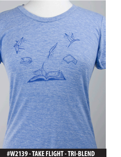
#W2139 - TAKE FLIGHT - TRI-BLEND