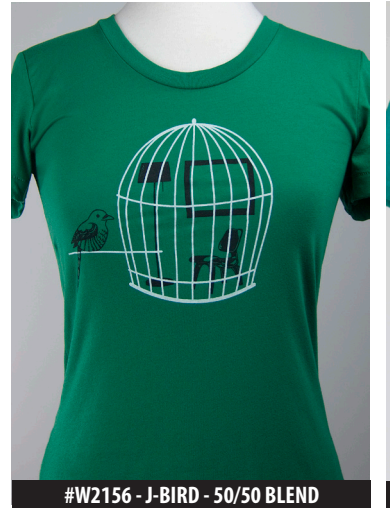
#W2156 - J-BIRD - 50/50 BLEND