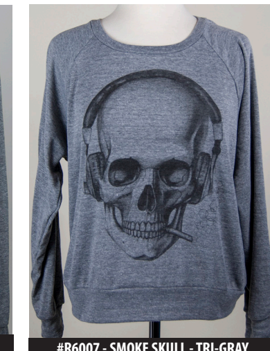
#R6007 - SMOKE SKULL - TRI-GRAY