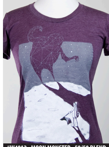
#W4012 - MOON MONSTER - 50/50 BLEND