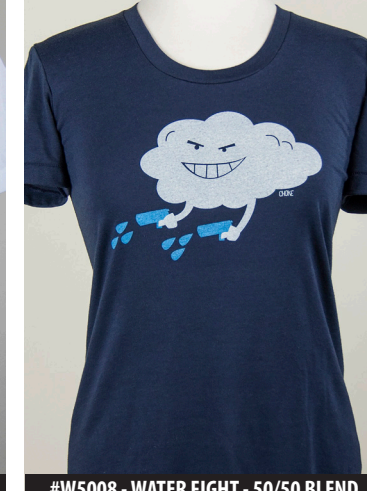
#W5008 - WATER FIGHT - 50/50 BLEND