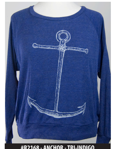
#R2168 - ANCHOR - TRI-INDIGO