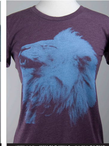
#W2105 - JUNGLE KING - 50/50 BLEND