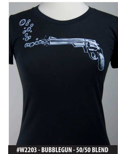
#W2203 - BUBBLEGUN - 50/50 BLEND