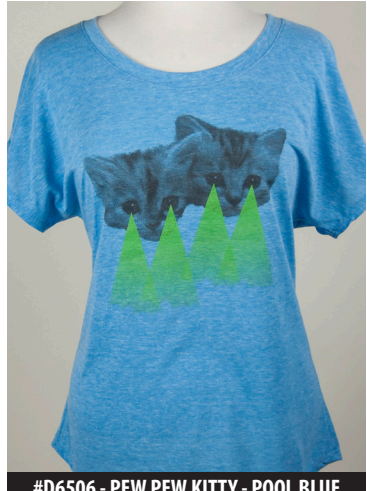
#D6506 - PEW PEW KITTY - POOL BLUE