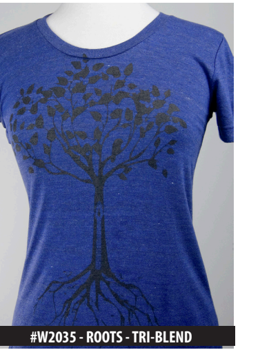
#W2035 - ROOTS - TRI-BLEND