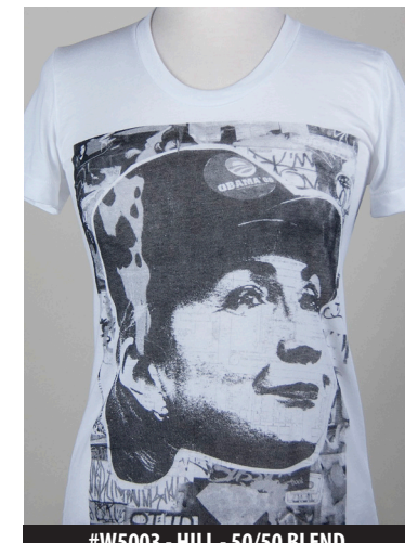
#W5003 - HILL - 50/50 BLEND