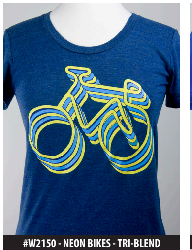
#W2150 - NEON BIKES - TRI-BLEND