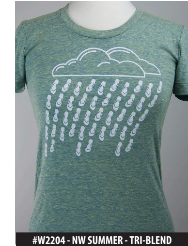
#W2204 - NW SUMMER - TRI-BLEND