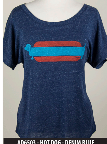
#D6503 - HOT DOG - DENIM BLUE