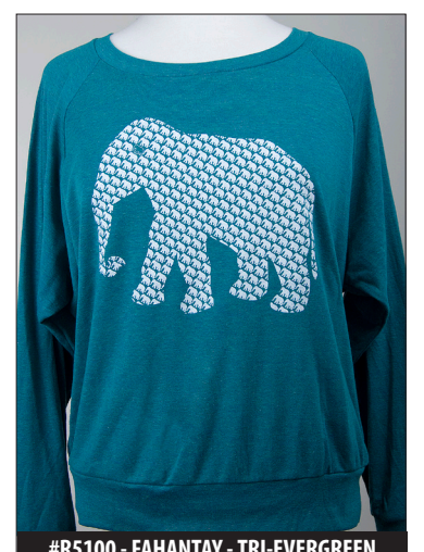
#R5100 - FAHANTAY - TRI-EVERGREEN