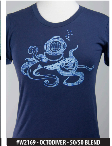
#W2169 - OCTODIVER - 50/50 BLEND