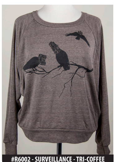
#R6002 - SURVEILLANCE - TRI-COFFEE