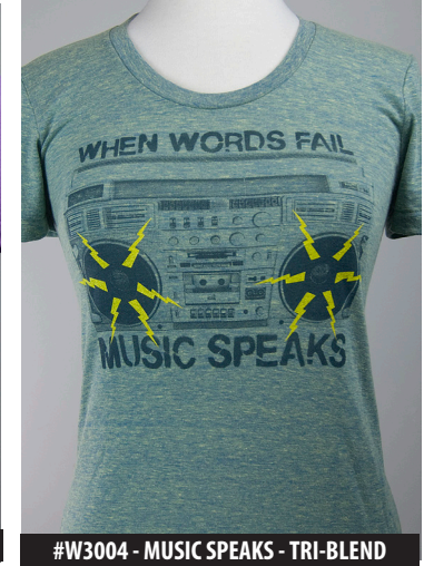
#W3004 - MUSIC SPEAKS - TRI-BLEND