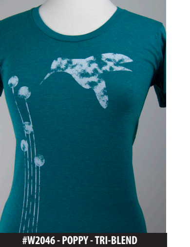
#W2046 - POPPY - TRI-BLEND