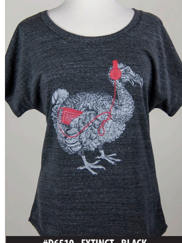
#D6510 - EXTINCT - BLACK