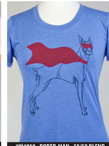
#W4010 - DOBER-MAN - 50/50 BLEND