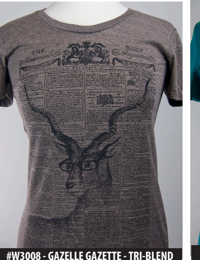
#W3008 - GAZELLE GAZETTE - TRI-BLEND