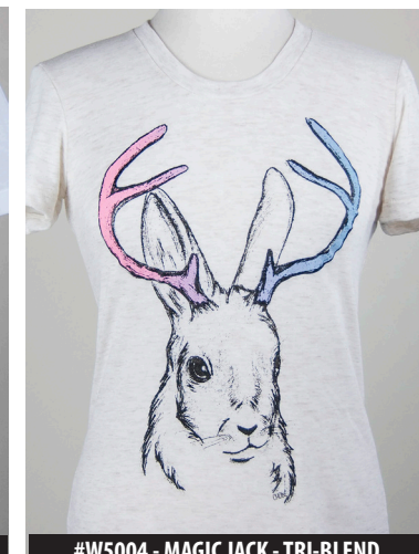
#W5004 - MAGIC JACK - TRI-BLEND