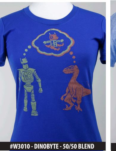
#W3010 - DINOBYTE - 50/50 BLEND