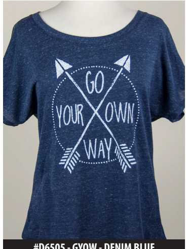
#D6505 - GYOW - DENIM BLUE