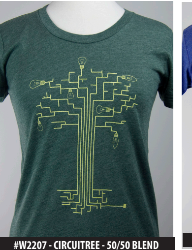
#W2207 - CIRCUITREE - 50/50 BLEND