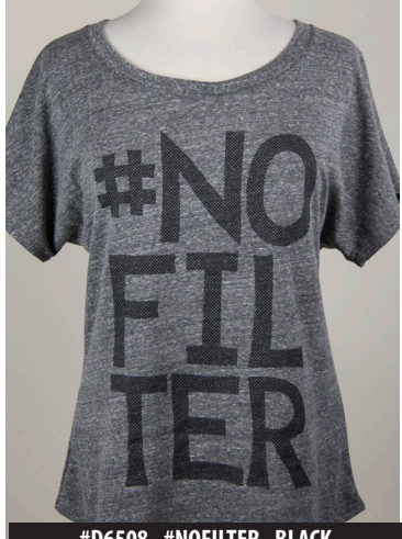
#D6508 - #NOFILTER - BLACK