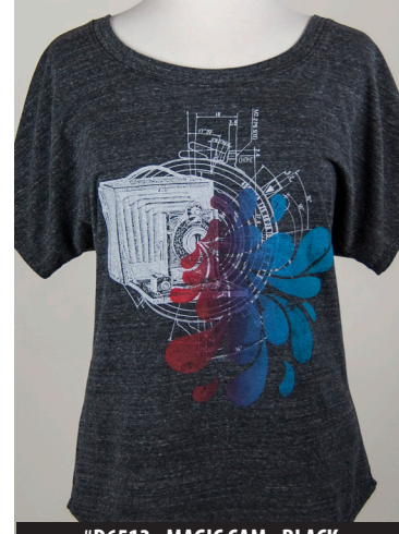
#D6513 - MAGIC CAM - BLACK