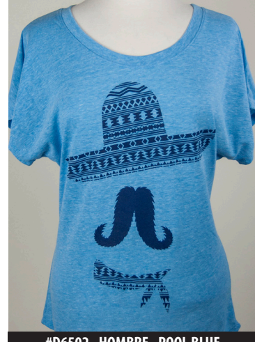
#D6502 - HOMBRE - POOL BLUE