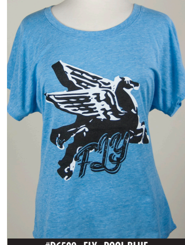
#D6509 - FLY - POOL BLUE