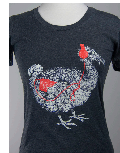
#3005 - EXTINCT - TRI-BLEND