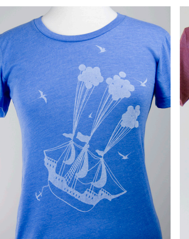
#W2104 - SAIL AWAY - 50/50 BLEND