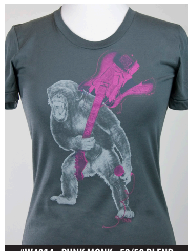
#W4014 - PUNK MONK - 50/50 BLEND