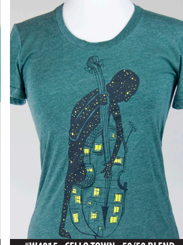
#W4015 - CELLO TOWN - 50/50 BLEND