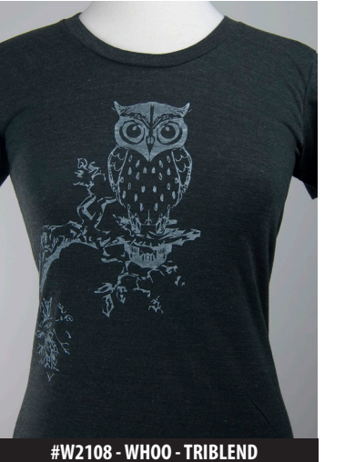
#W2108 - WHOO - TRIBLEND