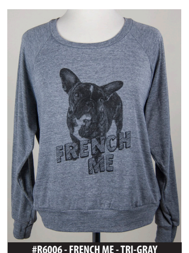
#R6006 - FRENCH ME - TRI-GRAY

RAGLANS Made in the USA A casual pullover in our light-weight Tri-Blend Fabric 50% Poly/25% Cotton/ 25% Rayon Available in small-large Sizing: Chest Length Sleeve Small 20.5" 18" 26" Medium 22" 19" 26.5" Large 24.5" 20" 27.25"