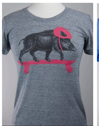
#W3007 - SKATEBOARDER - TRI-BLEND