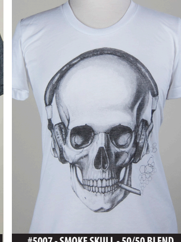
#5007 - SMOKE SKULL - 50/50 BLEND