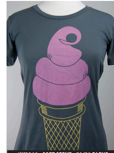
#W2210 - SOFT SERVE - 50/50 BLEND