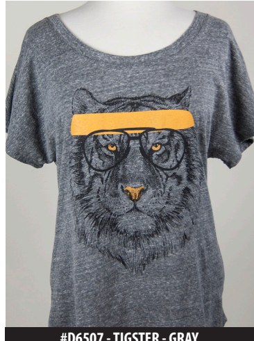
#D6507 - TIGSTER - GRAY