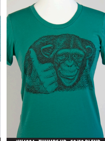
#W4004 - THUMBS UP - 50/50 BLEND