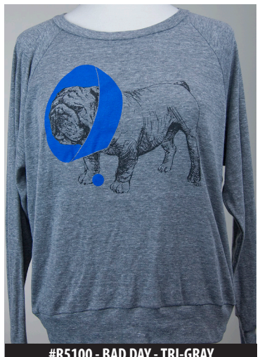
#R5100 - BAD DAY - TRI-GRAY