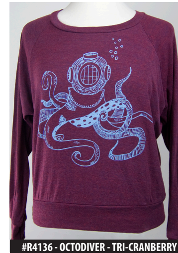
#R4136 - OCTODIVER - TRI-CRANBERRY