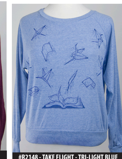
#R2148 - TAKE FLIGHT - TRI-LIGHT BLUE