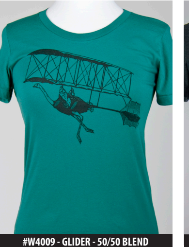
#W4009 - GLIDER - 50/50 BLEND