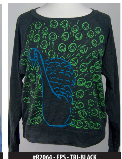
#R2064 - FPS - TRI-BLACK