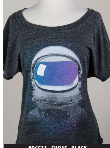
#D6511 - FUOAS - BLACK