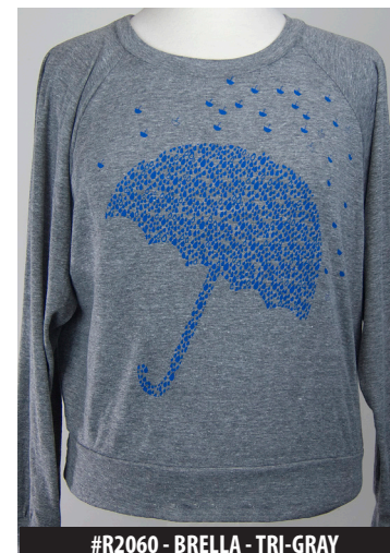
#R2060 - BRELLA - TRI-GRAY