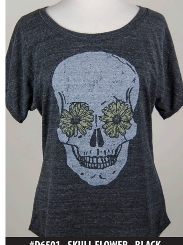
#D6501 - SKULL FLOWER - BLACK