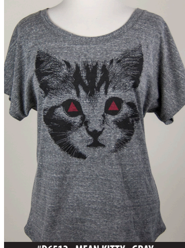
#D6512 - MEAN KITTY - GRAY