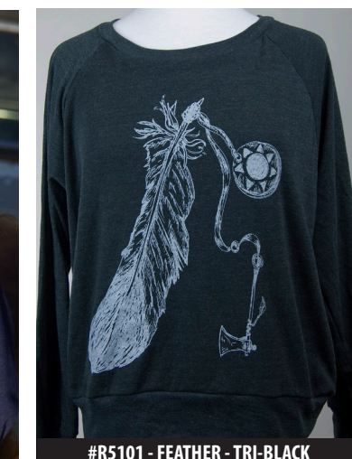
#R5101 - FEATHER - TRI-BLACK