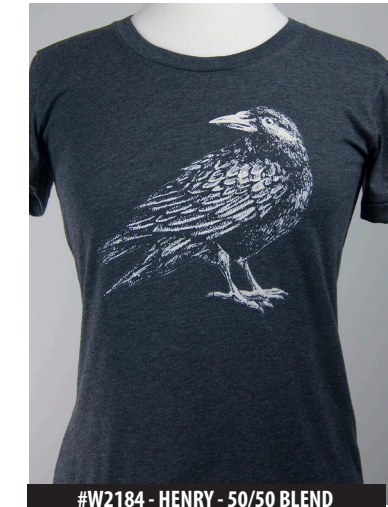
#W2184 - HENRY - 50/50 BLEND