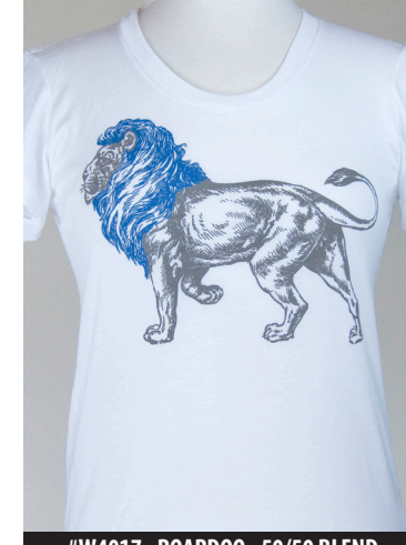
#W4017 - ROARDOO - 50/50 BLEND