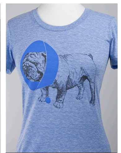
#W3006 - BAD DAY - TRI-BLEND