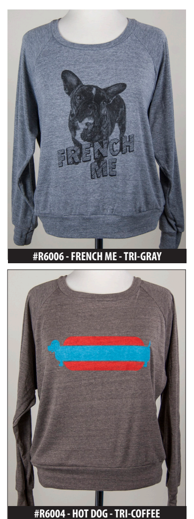
#R6004 - HOT DOG - TRI-COFFEE