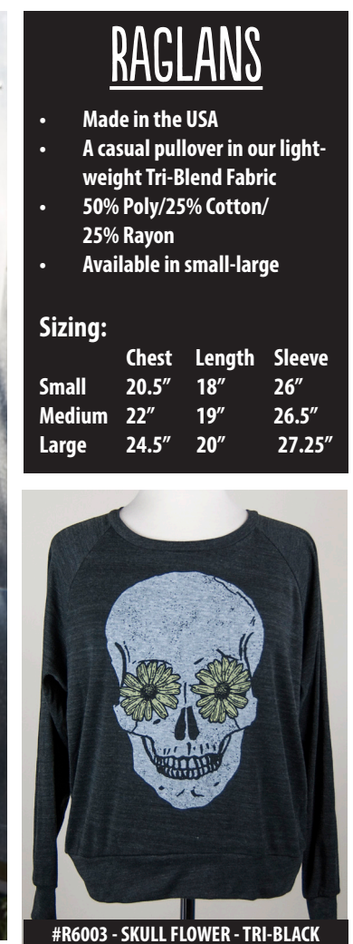
#R6003 - SKULL FLOWER - TRI-BLACK