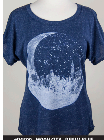
#D6500 - MOON CITY - DENIM BLUE