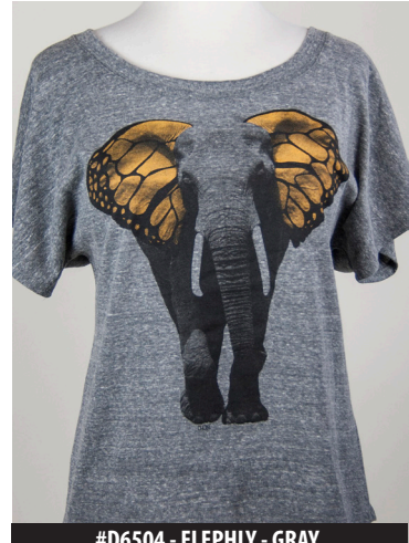
#D6504 - ELEPHLY - GRAY