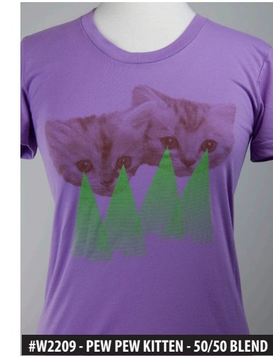
#W2209 - PEW PEW KITTEN - 50/50 BLEND