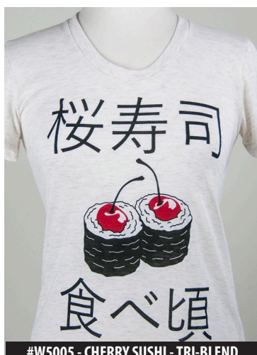
#W5005 - CHERRY SUSHI - TRI-BLEND