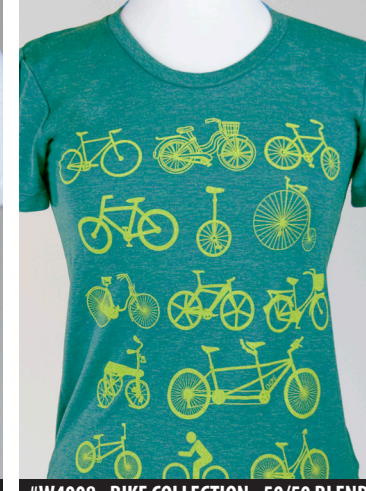
#W4008 - BIKE COLLECTION - 50/50 BLEND