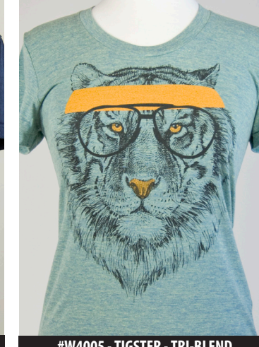
#W4005 - TIGSTER - TRI-BLEND