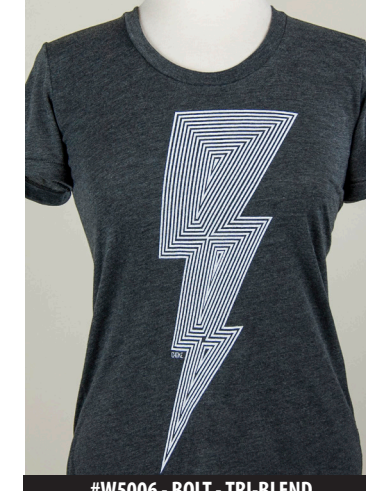
#W5006 - BOLT - TRI-BLEND