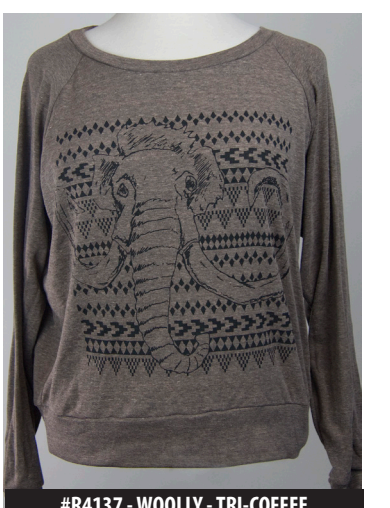
#R4137 - WOOLLY - TRI-COFFEE