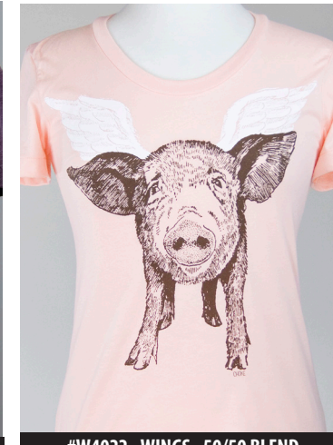
#W4022 - WINGS - 50/50 BLEND