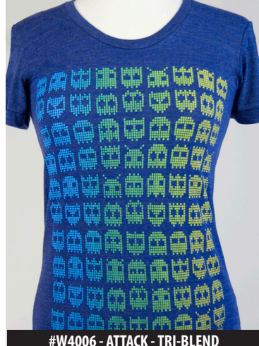
#W4006 - ATTACK - TRI-BLEND