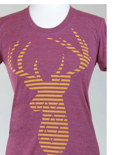
#W4019 - DEER HEAD - TRI-BLEND