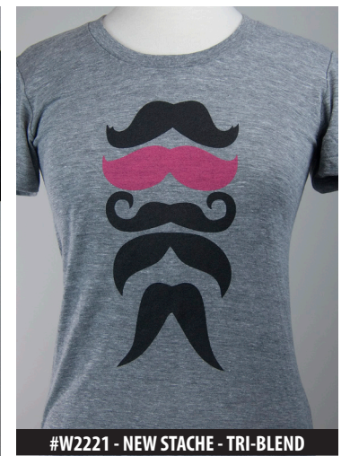
#W2221 - NEW STACHE - TRI-BLEND