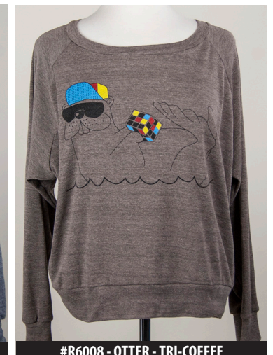
#R6008 - OTTER - TRI-COFFEE