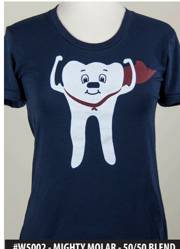
#W5002 - MIGHTY MOLAR - 50/50 BLEND