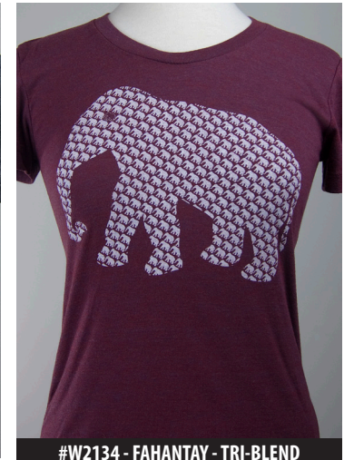
#W2134 - FAHANTAY - TRI-BLEND