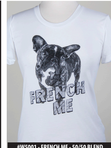
#W5001 - FRENCH ME - 50/50 BLEND