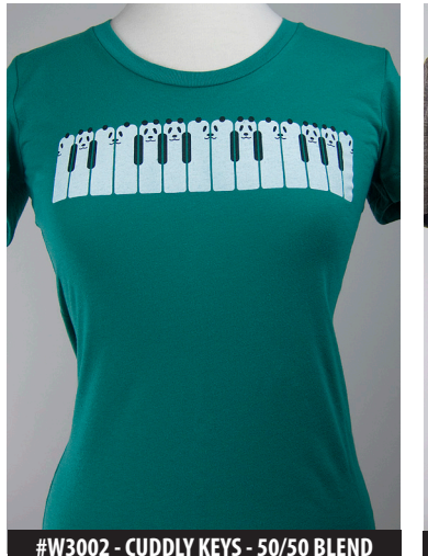
#W3002 - CUDDLY KEYS - 50/50 BLEND